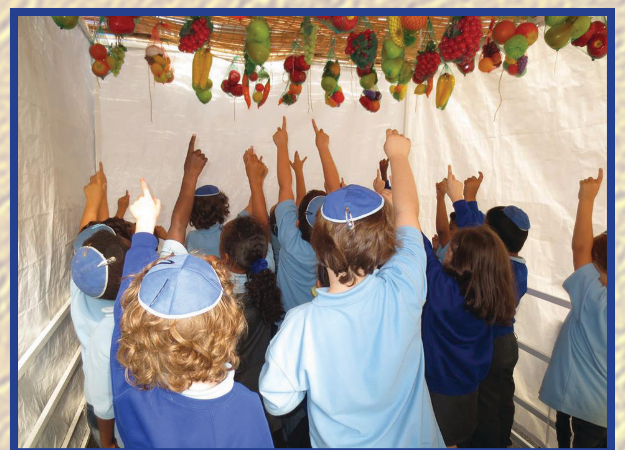
School children in sukkah c.2000.