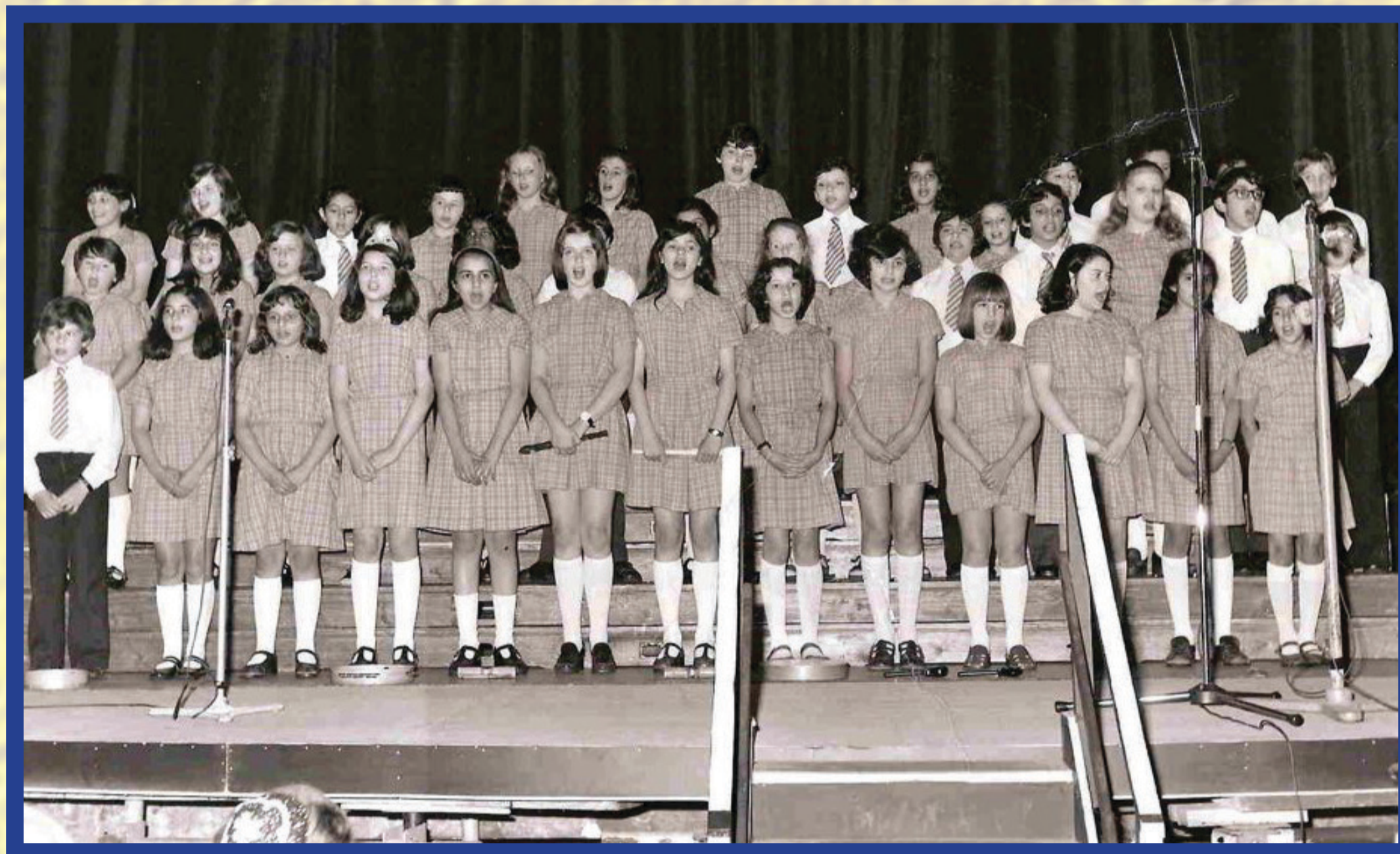
Simon Marks Primary School Choir singing at Wembley, c.1975.

The local secondary schools in Ilford had a high proportion of Jewish children: