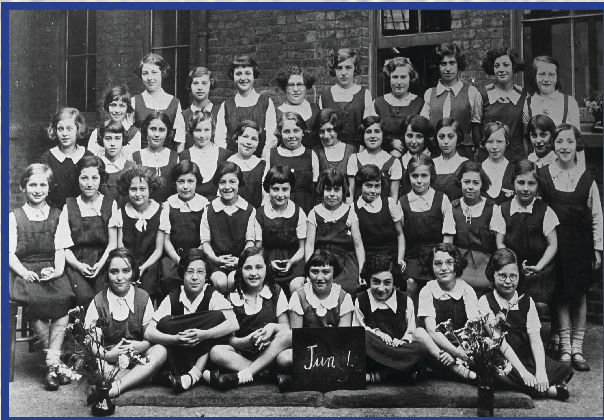
Stepney Jewish Girls School, 1930.

In 1970 the Stepney Green Jewish School moved to Ilford: