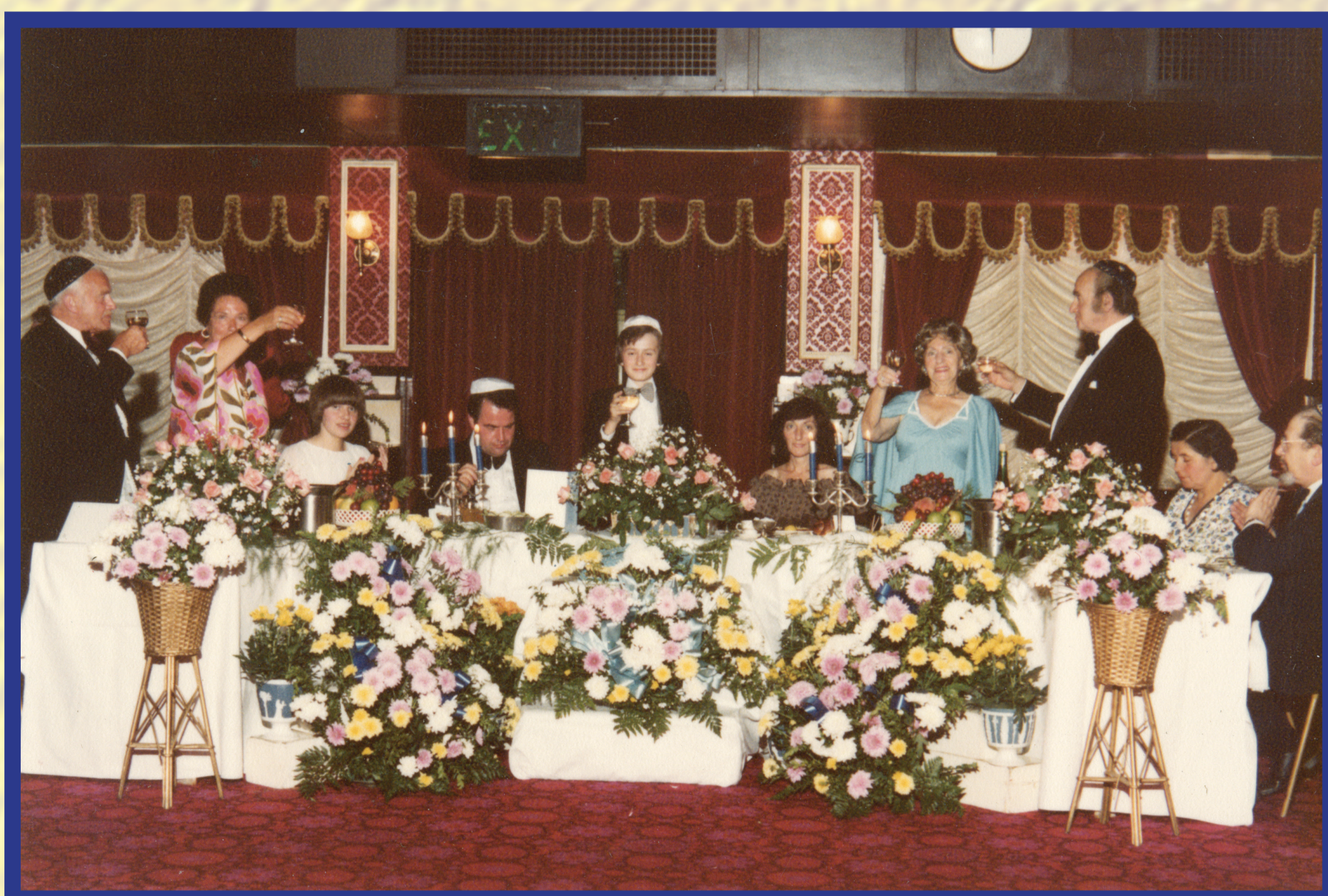
Bar Mitzvah Celebration, late 1970s.