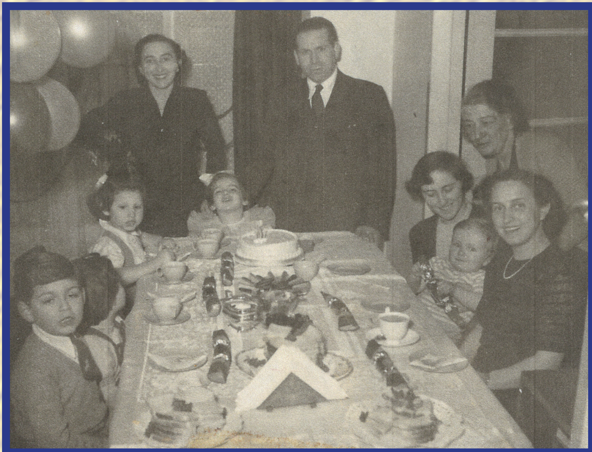
Family celebrations in a Jewish Household, c.1950.

Redbridge had, in fact, been home to a small community of Jewish people since the 1920s.