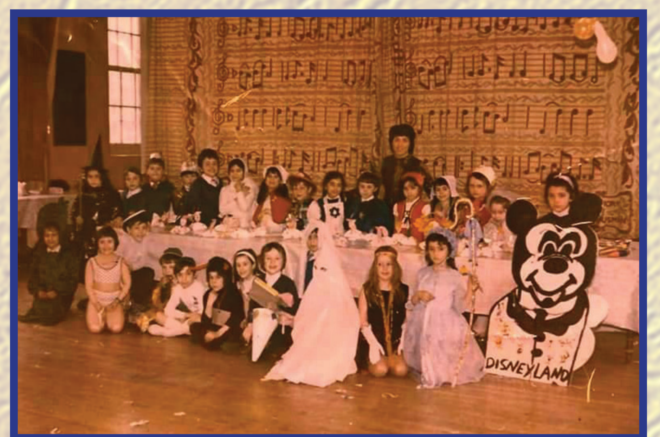
Purim at Simon Marks Primary School, c.1975.